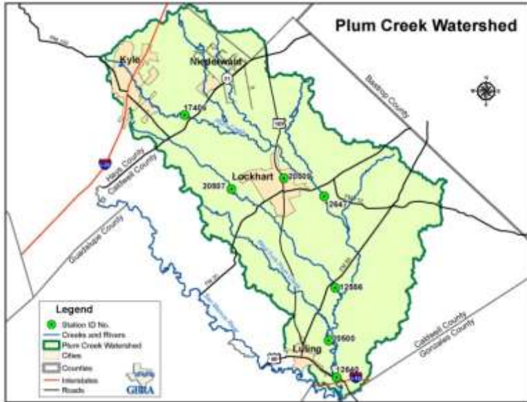
Figure 2. Map of Plum Creek monitoring locations.