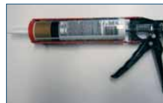
Figure 5. Caulking gun and sealant.