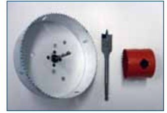
Figure 9. 6-inch hole saw, 1-inch paddle bit, and 2 3/8-inch hole saw.