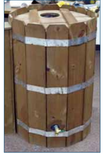
Figure 19. Covered rain barrel.