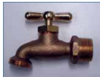
Figure 4. ¾-inch hose bib.