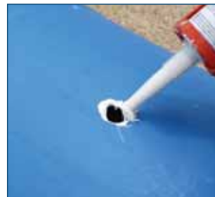
Figure 11. Step 2b.