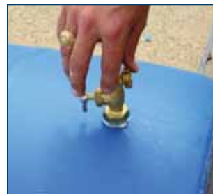
Figure 12. Step 2c.