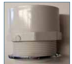
Figure 6. 2-inch PVC male adapter and electrical nut.