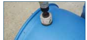
Figure 14. Step 3b.