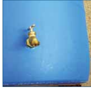
Figure 17. Hose bib facing down.