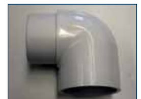
Figure 7. 2-inch PVC street elbow.