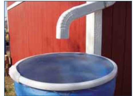
Figure 20. Ideal placement of a barrel.

Be sure everyone knows that the water in the barrel is not safe to drink. Put a non-potable label on the barrel or remove the faucet handle when not in use.