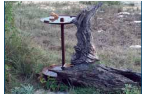
Figure 23. Bird bath made from a plow disc with a drip emitter in an old log.