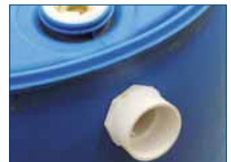
Figure 15. Step 3c.