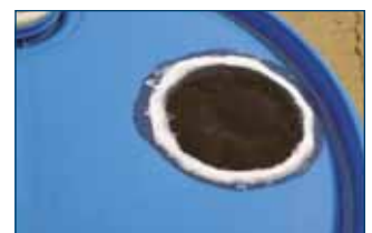
Figure 16. Step 3f.