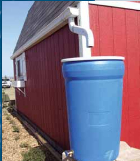
Figure 1. Example of rain barrel.