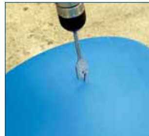
Figure 10. Step 2a.