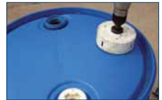
Figure 13. Step 3a.