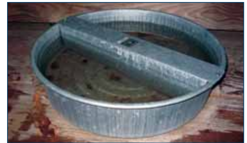
Figure 22. Pet watering tray connected to a rain barrel.