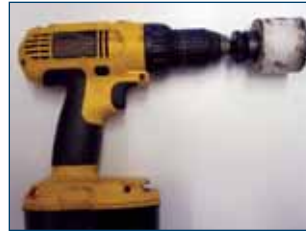
Figure 8. Drill and 2 3/8-inch hole saw.

Note that these materials and tools can be changed to adapt to your rain barrel and the way you will use it. Example: A 1 1/2-inch coupling can be used instead of a 2-inch. Always use safety precautions when using power tools.