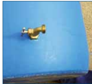
Figure 18. Hose bib facing to the side.