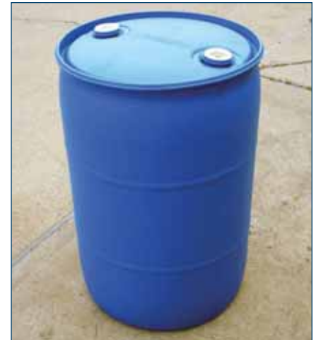
Figure 3. Barrel with a sealed lid.